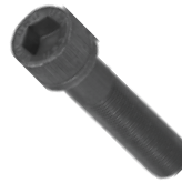
• Socket Products